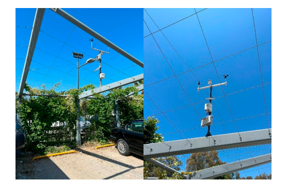
Figure 3. HOBO RX3000 meteorological station installations (Vilayetler Evi on the left, Sasalı Natural Life Park on the right).

The data were collected from the meteorological stations of Vilayetler Evi and Sasalı Natural Life Park zones, which were installed within the scope of the European Union's Horizon 2020 project [27] between 1 January 2017 and 31 December 2021. However, for the statistical analysis, the raw data were subjected to the elimination of outliers and meaningless data. These stations were selected according to urban-nature continuum principles. A total of 21,710 data points of PM<sub>10</sub> concentrations and meteorological parameters were used in this study. The stations use Model 5014i Beta Continuous Particulate Monitors [31] for PM_{10} measurement. The PM_{10} data were collected hourly by the air quality monitoring stations which are close to the Vilayetler Evi and Sasalı Natural Life Park zones. The meteorological parameters used in the study are wind speed (WS), wind direction (WD), temperature (Tair) and relative humidity (RH). Two HOBO RX3000 meteorological stations [32] were installed in two study zones, Vilayetler Evi and Sasalı Natural Life Park (Figure 3). The sensor specifications of the meteorological stations are given in Table 2. The north, east, south and west directions are 0°, 90°, 180° and 270° for the WD. Meteorological stations collect data at 10 min intervals. Since the PM_{10} data are collected hourly at the air quality monitoring stations, meteorological data are also converted to hourly averages.