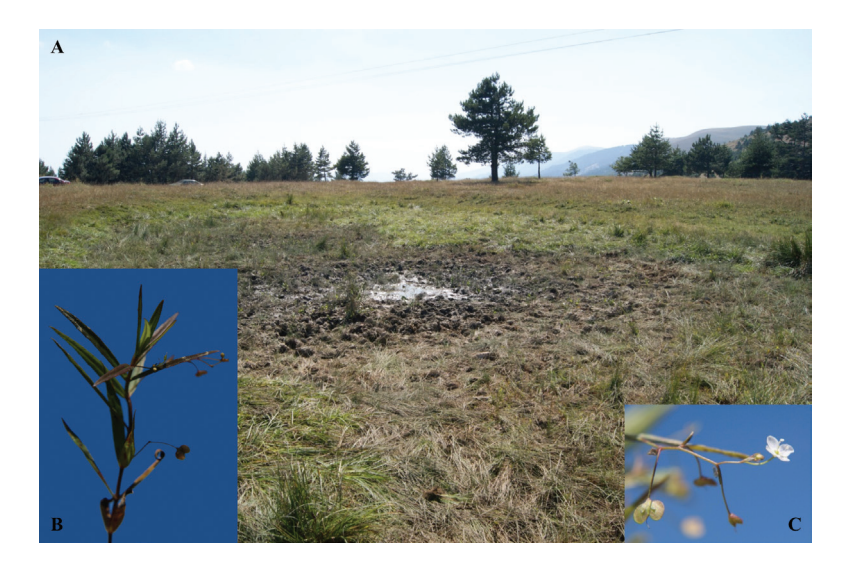
FIGURE 1. The photos were taken from Abant Region in August showing A- Natural habitat of V. scutellata , B- Aboveground parts of the plant and C- Flowers